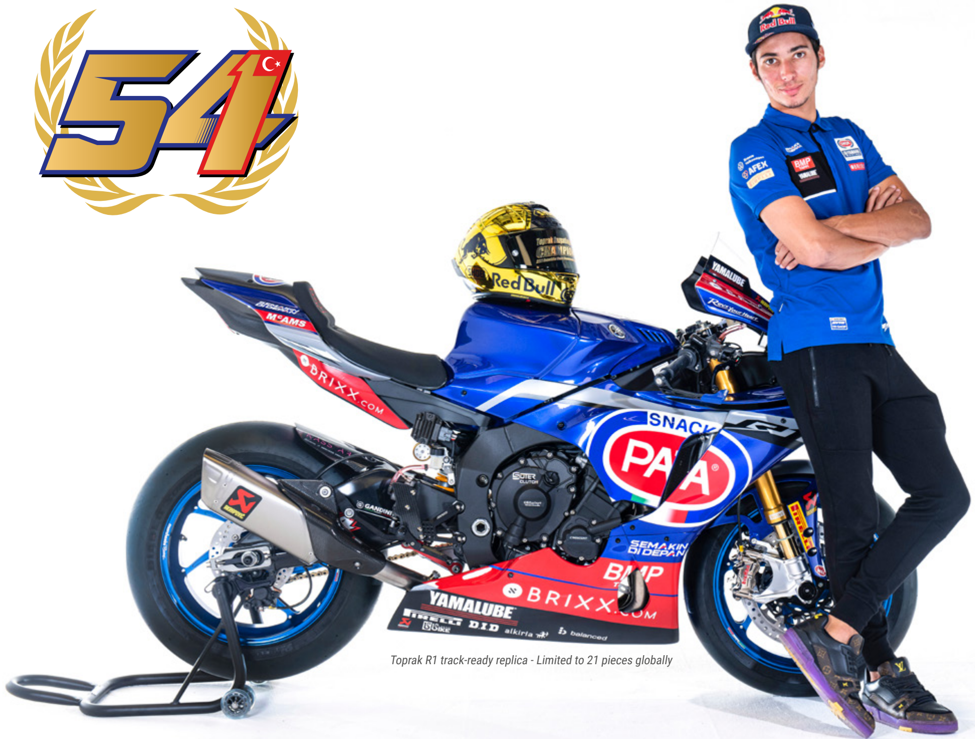
Toprak R1 track-ready replica - Limited to 21 pieces globally